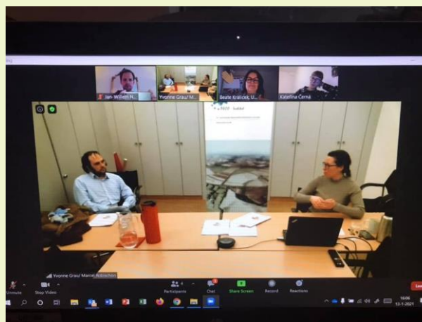
Dissemination of the results of the Agritrain project, by Humboldt University, Berlin, January 2021

Are you interested to start an easy 3-year BIP-cooperation between 3 ENTER members? Check the details of the BIP structure, get in touch with your colleagues and international agency, raise up meaningful content and bring your ideas with you to the next ENTER Study Days. We will arrange a workshop around this topic on the third day!