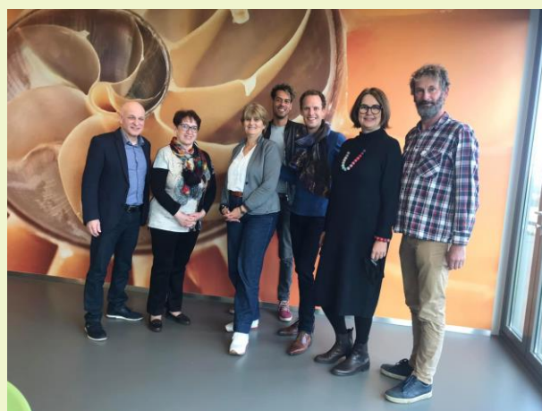
Board meeting at Aeres University of Applied Sciences in Wageningen, Netherlands, Nov. 2021

After the success of the first online ENTER seminar, we are currently planning a follow up in Spring 2022 . A new online semi-informal event where we can share a substantive topic that unites. Stay tuned for the date that will be shared on the webpage, social media and by email.